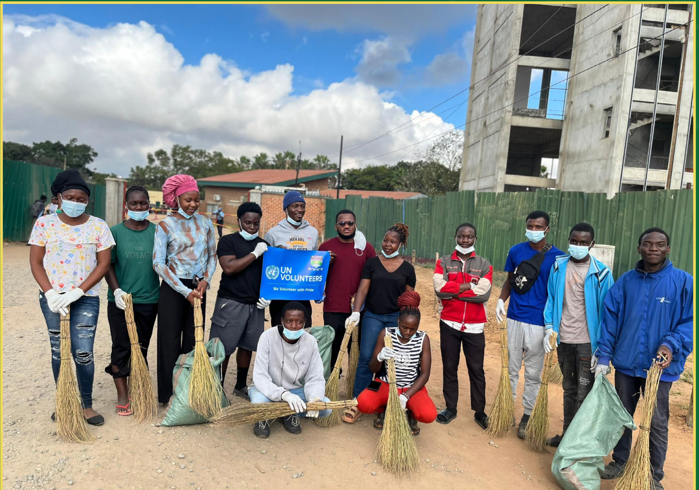
The students are committed to promoting cleanliness on Campus

MZUNI UN Volunteers conducted a Campus Cleaning Exercise on Saturday, 16th May, 2026 to promote campus cleanliness and environmental sustainability, and to enhance the volunteering experience among students.