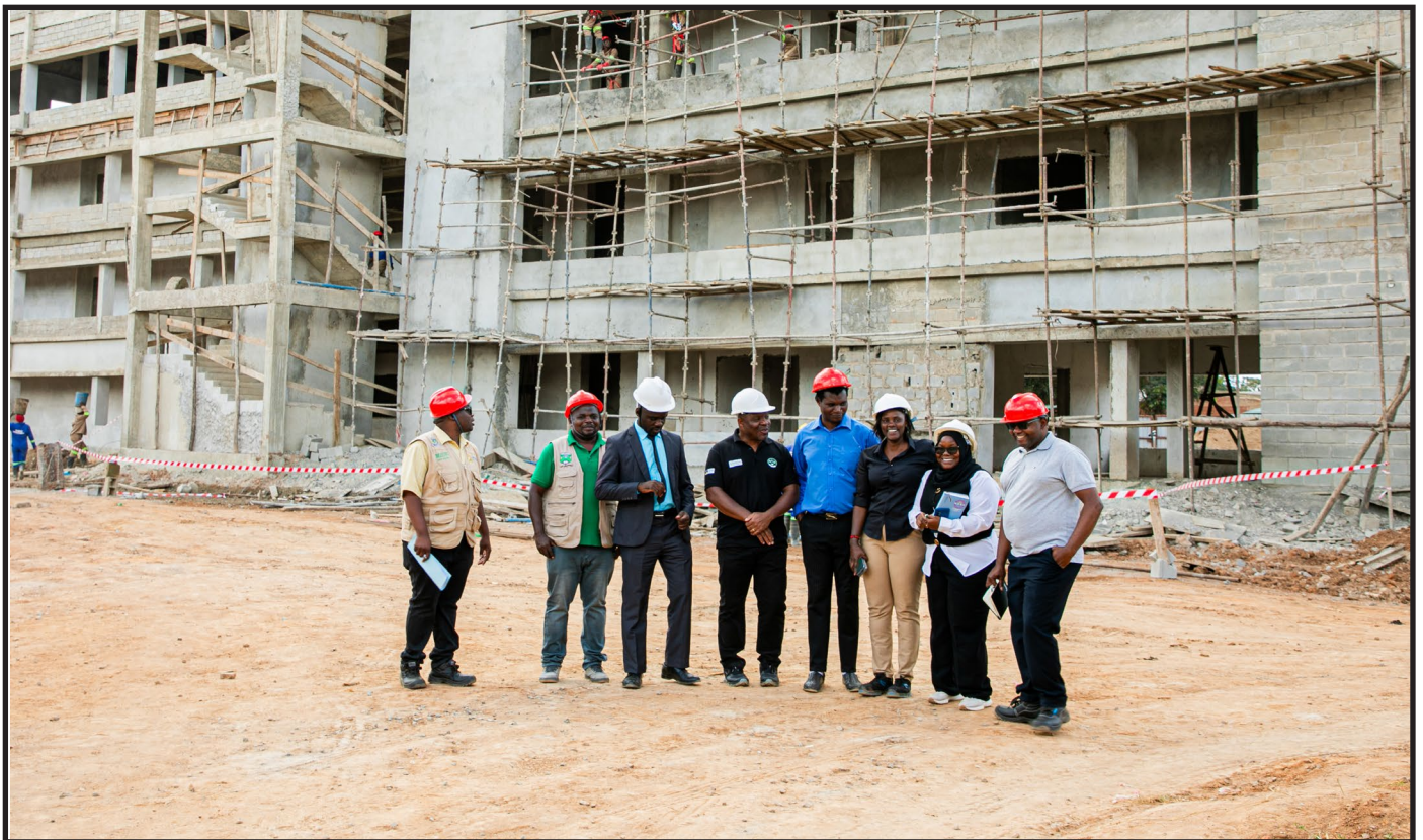
On Friday, members of the Manifesto Implementation Unit visited the University. Among others, the members appreciated MZUNI's development projects, including the construction sites of the new MZUNI Library, the African Centre of Excellence in Neglected and Underutilised Biodiversity (ACENUB) and Entrepreneurs Training and Incubation Centre (ETIC)