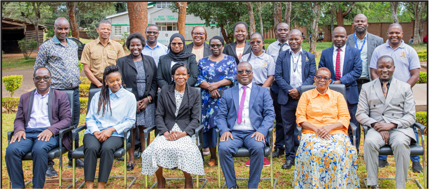
Members of Parliament IIC and MZUNI IIC pose for a group photograph

The Parliament of Malawi's Institutional Integrity Committee (IIC) visited Mzuzu University (MZUNI) on 11 May 2026 to learn from the experiences, best practices, and lessons on promoting integrity systems and strengthening measures to prevent fraud and corruption within public institutions.