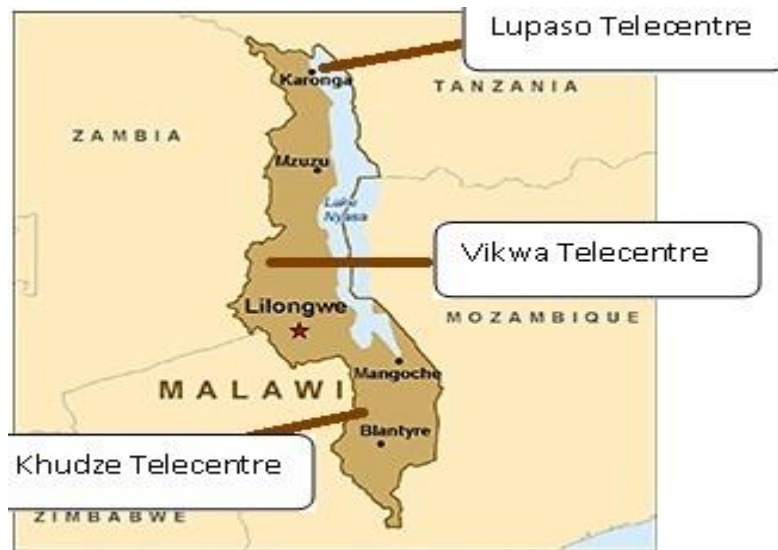
Figure 1: Map of Malawi showing location of telecentres

Figure 1 shows the location of the telecentres on a map of Malawi.