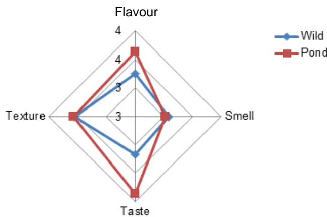
Figure 3. Consumer mean sensory scores for wild and pond raised Oreochromis karongae .

karongae (kite pulled outside - Figure 3) but were indifferent for wild O. karongae . With an exception of meat balls, boiled, fried and filleted pond raised O. karongae was significantly liked in all organoleptic attributes ( P < 0.05 ) (Table 2).